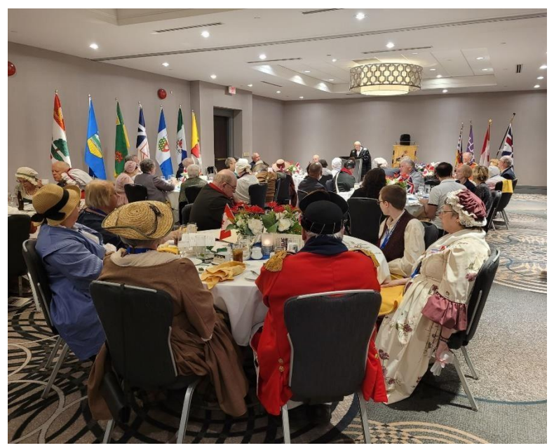
The June 3 Evening Banquet