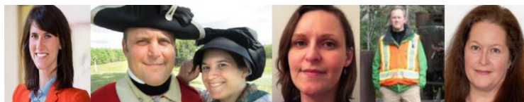
Some UELAC Scholarship Recipients

The UELAC Loyalist Scholarship is available to Masters and PhD students who are undertaking a program in relevant research. The topic should further Canada's understanding of the Loyalists and our appreciation of their, or their immediate descendants, influence on Canada.