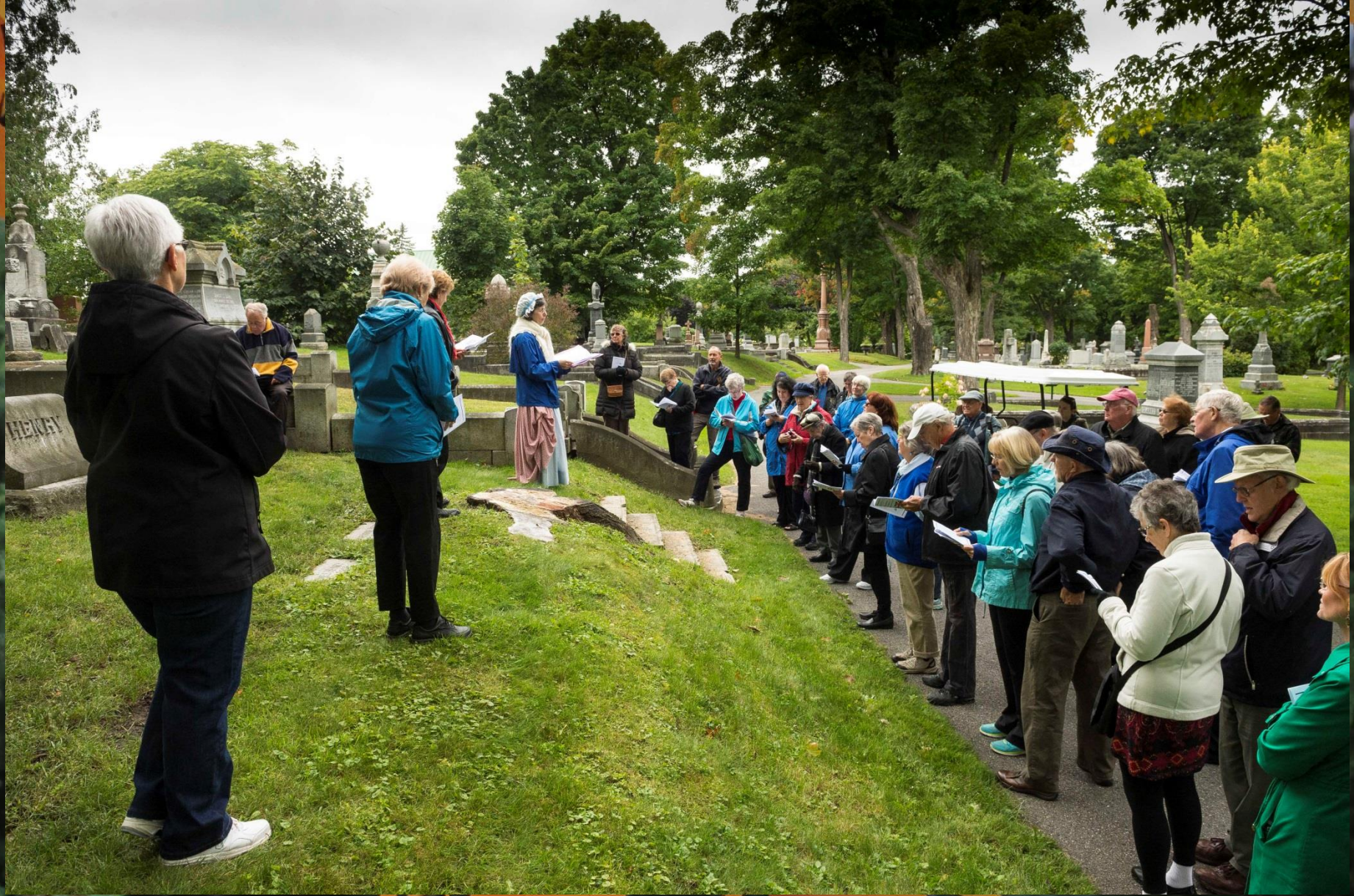
At the grave of Henry Marshall Tory